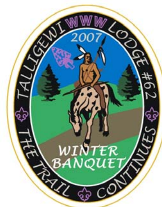
2007 Winter Banquet Patch Design

Please feel free to submit your questions or comments about patch collecting to us at info@talligewi62.org . If your question is selected for a future column we will give you a free Lodge Flap.