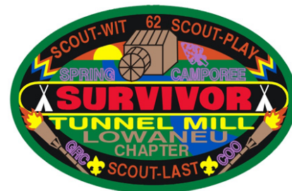
Lowaneu Chapter 2007 Camporee Logo