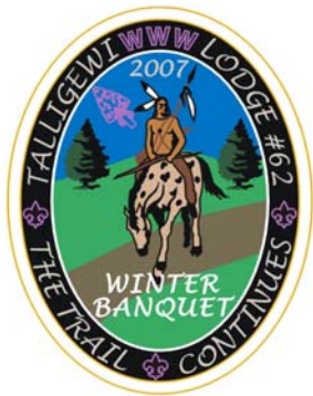
2007 Winter Banquet Logo

It is important that we have a good attendance this year as we