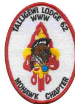
Mohawk Chapter X-1

the Cooper Memorial United Methodist Church at 7:00 pm, the same place and time of the Mohawk Roundtable. All OA Members in the Mohawk District are urged to attend and help plan activities for the OA Chapter.