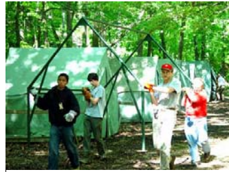
Candidates working at the May Ordeal

Help us end the year with a bang and make these weekends events to remember.