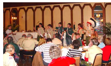
Lodge Officer Inductions at the 2005 Winter Banquet

special treat this year's slide show looked back upon all ten years we have had as a lodge. Considering the success of this year's banquet you should start making plans for next years.